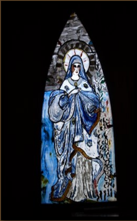
Stain glass window from St. Alban's Anglican Church