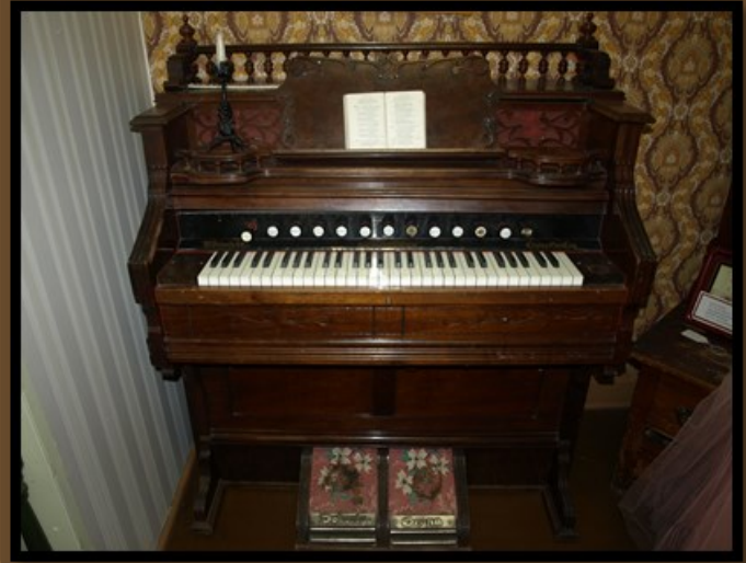
Organ from St. Alban's Anglican Church