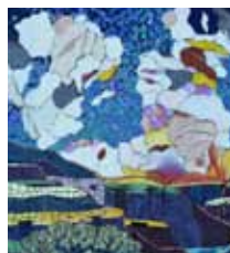
A.Y. Jackson Ashcroft painting, Sept. 06, 1945

St. Cloud was the first name given to Ashcroft c. 1860 by Sr. William Cornelius Van Horne, General Manager of the CP Railway. The locals, however were already calling the town Barn Station but this name did not stick either. Rather than go to the trouble and expense of changing the post office's name from its previous designation, the surveyor general decided to retain the name of Ashcroft.