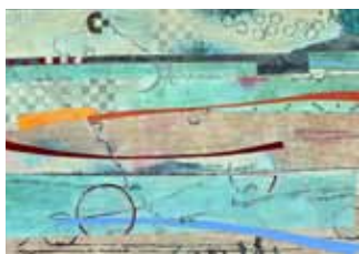
"Winds of Change"