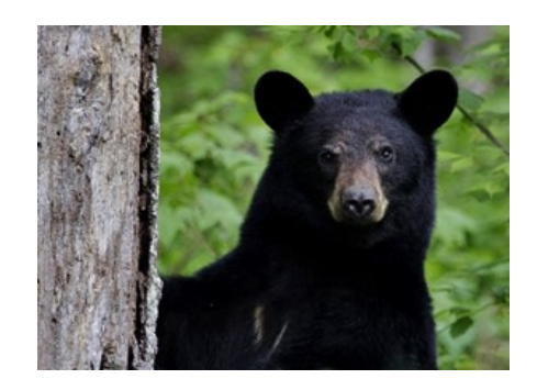
PO Box 129 601 Bancroft St. Ashcroft, BC

'TIS THE SEASON! PLEASE BEAR PROOF YOU PROPERTY