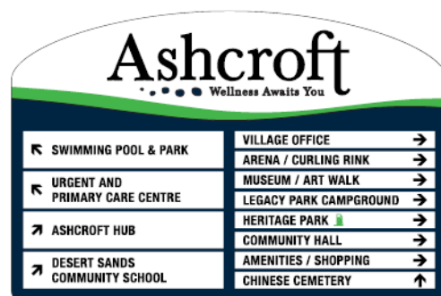
option 4 - 72" w x 48"