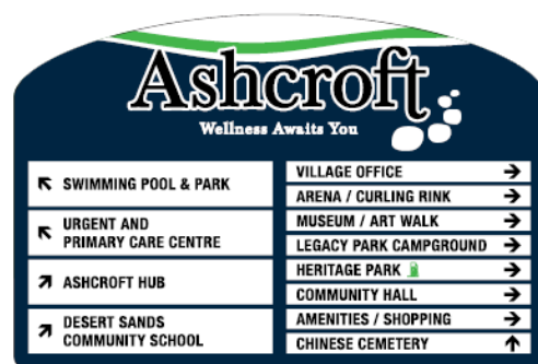
option 2 - 72" w x 48"