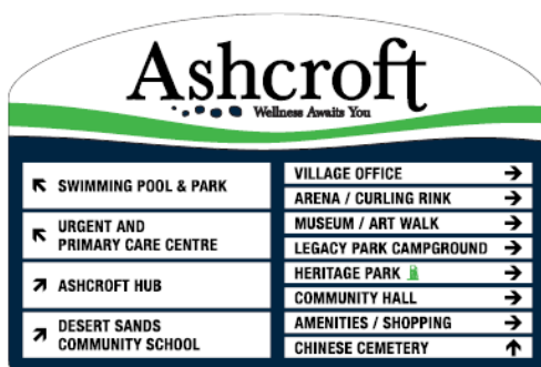
option 3 - 72" w x 48"