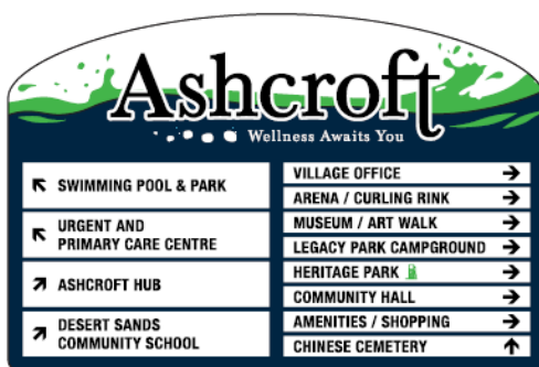
option 1 - 72" w x 48"

To resolve the issues, the working group tried to marry the “Oasis in the Desert” with the “Wellness Awaits You” brand while keeping the vibrant blues and greens that pop in the desert landscape; however, changing the existing brands color scheme adds another layer of complexity and ambiguity. The following images are a variation of the designs.