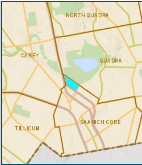
Property location within District of Saanich