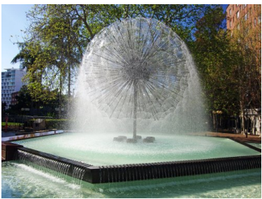
DANDELION SCULPTURE FOUNTAIN