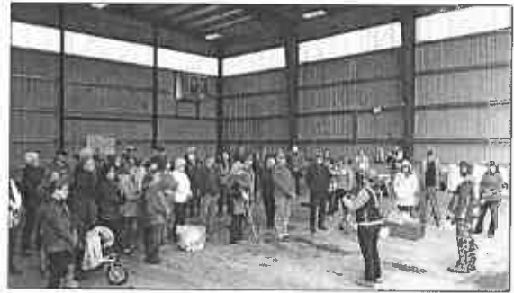
A RECENT EDUCATION SESSION

With the launch of the new program comes recycling education sessions at the Clearwater Eco-Depot and the Vavenby Transfer Station, both of which are being used as pilot sites.