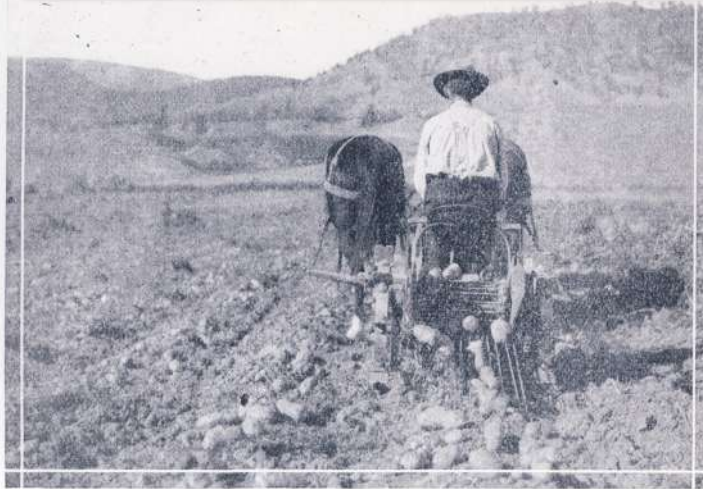
Potato Digger in Operation on Basque Ranch.